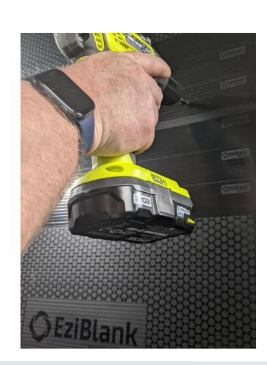
6. Secure new section with self tapping screw