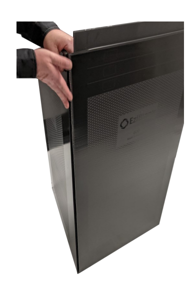
2. Velcro together ensuring that there is a straight line along the 600mm side corner as shown above