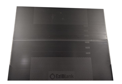
7. New height extended Eziblank® Modular Wall structure complete and inplace as above image.