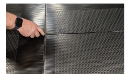
3. Cut along flute with the aid of a straight or hooked blade