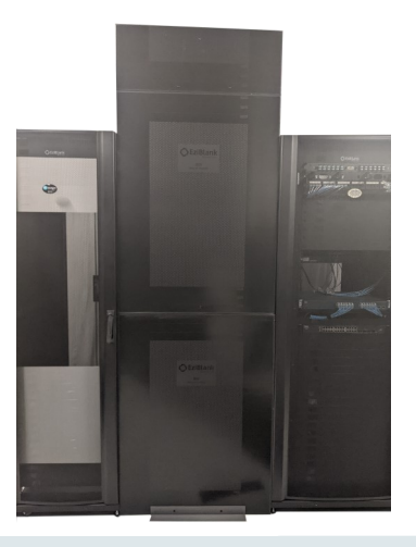
8. The Eziblank® Modular Wall structure with extended height is shown above.