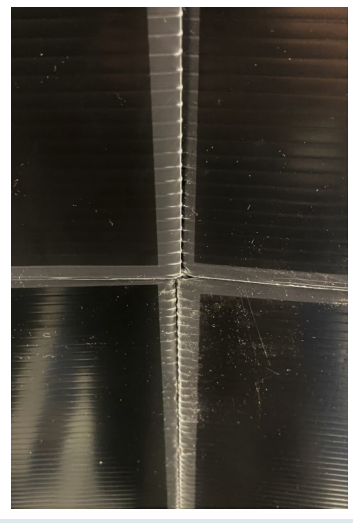
7. All 4 Modular Wall pieces together should look like the above picture