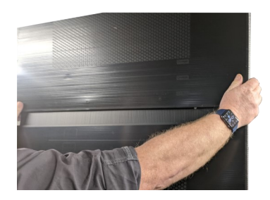
5. Position newly completed Mod Wall section on top of existing Wall structure