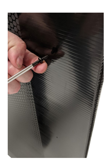
3. For added structural integrity, install the provided screws in two of the provided 3mm pilot holes (see Image 3 above)