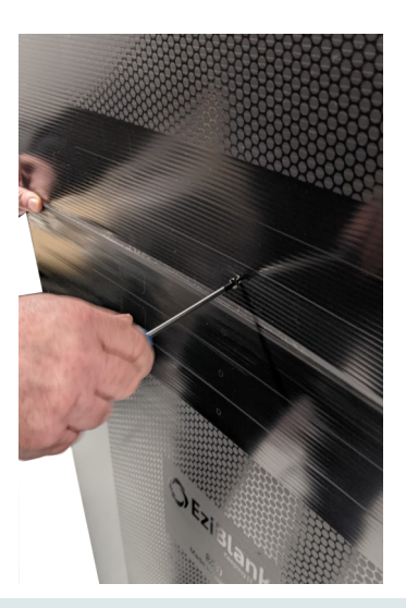
5. Install the provided self-tapping screws to each of the three sides of the structure securing the outside face to the stability flap.