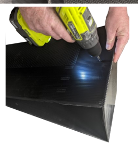
4. Assemble height adjusted Modular Wall extension section and secure with self tapping screw