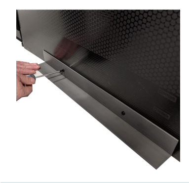
Simply install provided selftapping screws to secure the Angle to the bottom of the cold aisle-facing side

For added stability, the Wall Angle accessory is available. They come in a pack of 4 with required screws and double-sided tape.