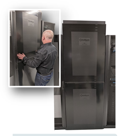
6. Your energy saving Modular Wall structure is ready for deployment