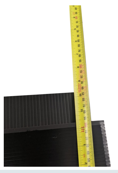
Measure required addition height from top of the Modular Wall