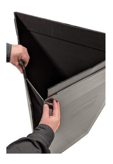
1. Bring flap and 750mm side together to form the triangle structure **