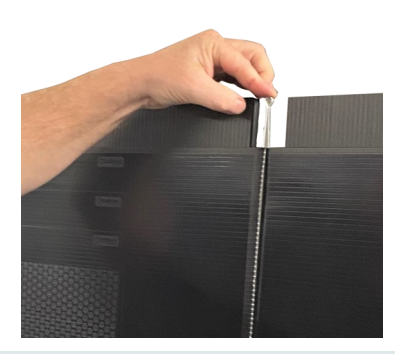
8. Finally, with the aid of a ladder, insert the final pin to secure the top halves of the two Modular Wall structures together