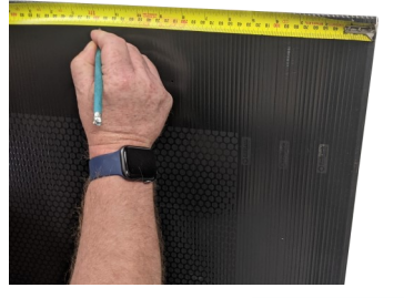
2. Measure from base of Modular Wall and mark