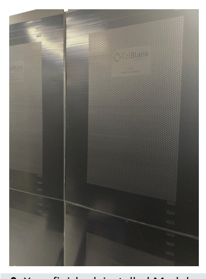
9. Your finished, installed Modular Wall structure should look like the picture above

NOTE: The above picture uses 2 packs of Modular Walls (EZWM23UPNL02)